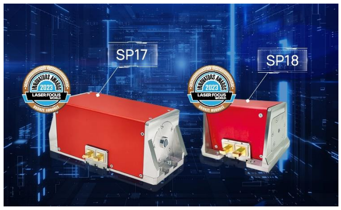
Laser Focus World Innovator Awards 2022 Bronze Award

Utilizing Focuslight's advanced high-power diode lasers as the core component, and employing unique optical design, water flow design, and the ASE (Amplified Spontaneous Emission) effect control method, SP17 & SP18 achieve high-peak-power, high gain, and high uniformity of fluorescence distribution. As the gain increases, the highpeak-power pumping module will generate a serious ASE effect if no corresponding measures are taken, which results in gain saturation and in the end, prevents the module from a high SSG value. SP17 and SP18 side pumped modules take effective measures to inhibit the ASE effect.